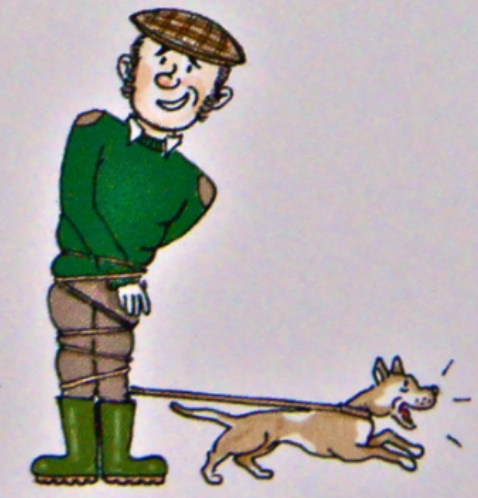
I'm lost without my dog