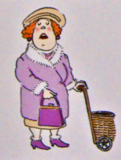
I don't speak a foreign language