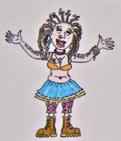
I don't care what people think