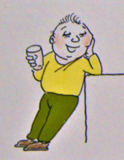
I never refuse a drink