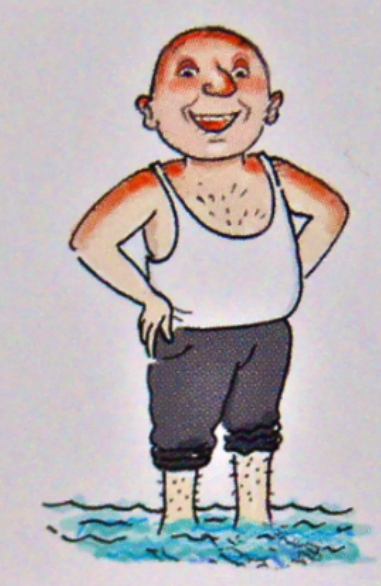
I'm a different person when the sun's out