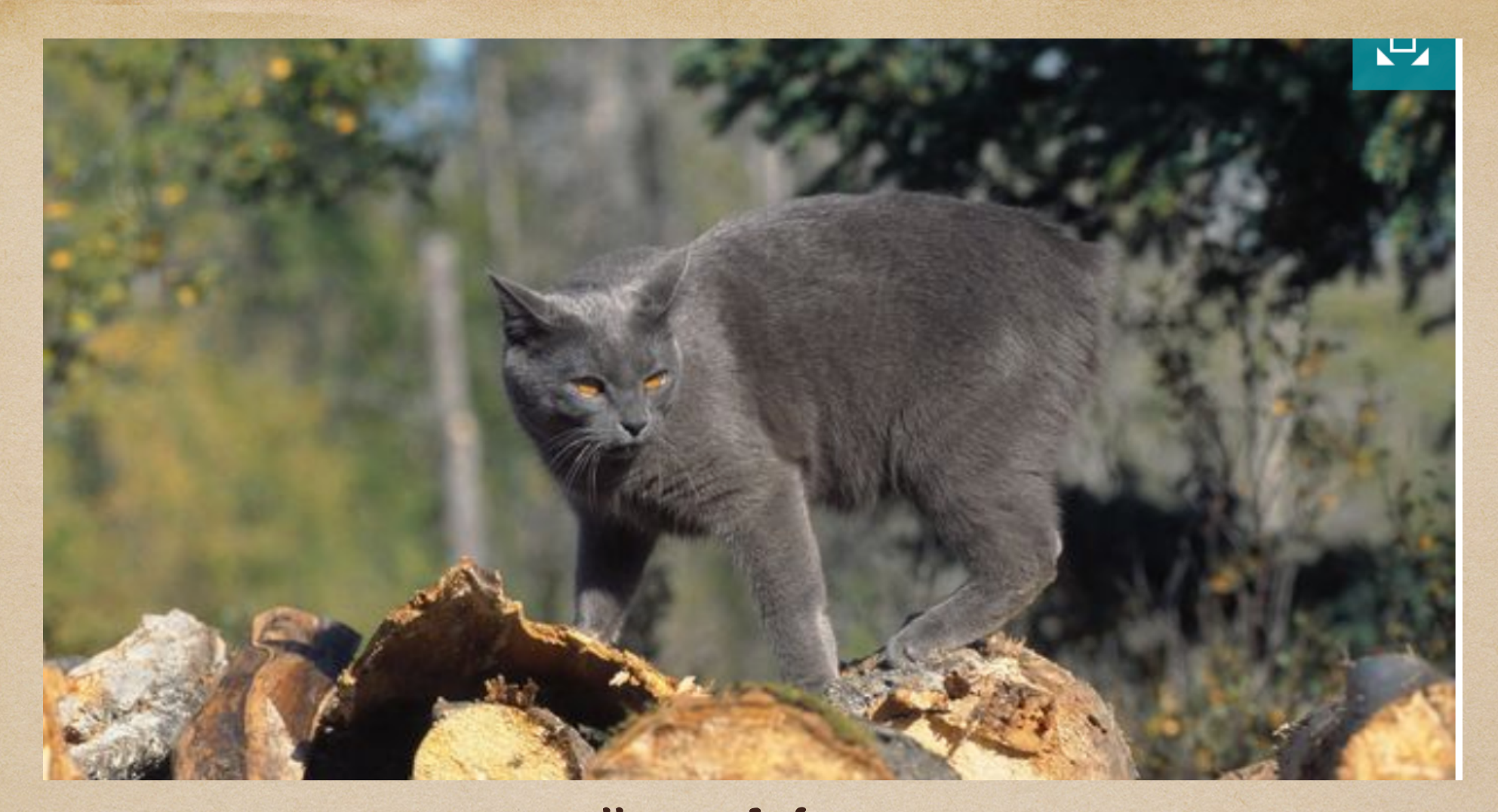
a tailless Manx cat - were known by the early 19th century as cats from the Isle of Man