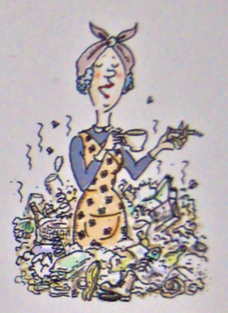
I'm not bothered about a bit of dust