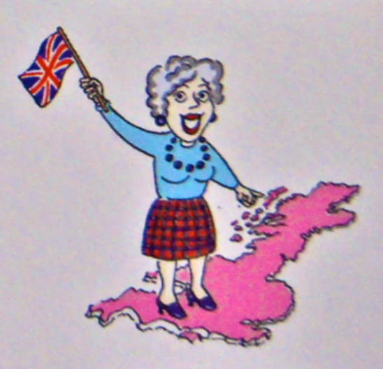
I wouldn't live anywhere else!