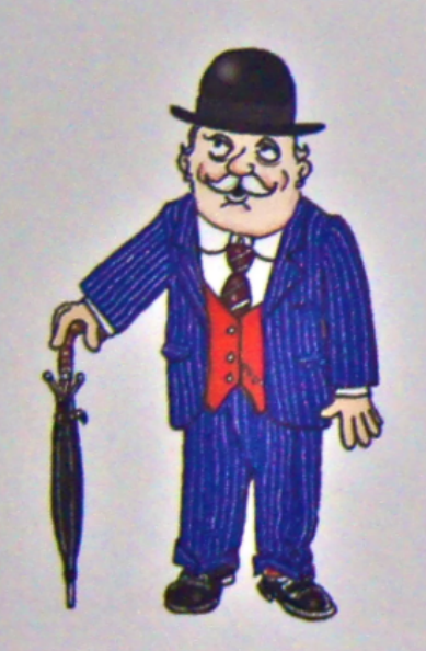
I live in the past